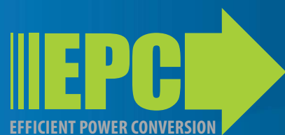
Table data subject to change. Please refer to the Product section on www.epc-co.com